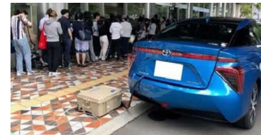
An FCV powering mobile phones at Sapporo City Hall in Hokkaido