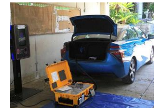
An FCV supplying power in Chiba