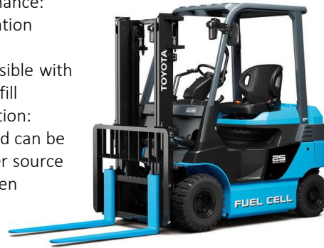
2.5t Fuel Cell Forklift * 2