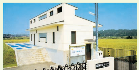
Large-scale Johkasou (RC-made)