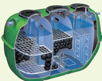
Small-scale Johkasou (FRP-made)