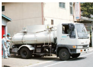
A normal vacuum truck