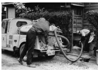
The first small vacuum truck in 1960s (6)