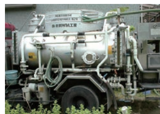
A vacuum truck with concentrating function