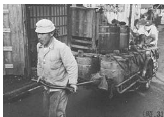
A two-wheeled cart in 1950s (6)