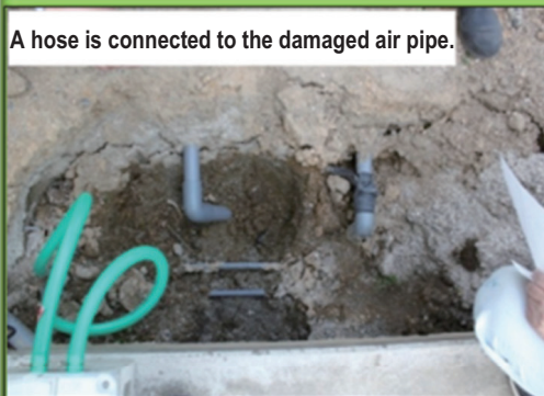
A hose is connected to the damaged air pipe.