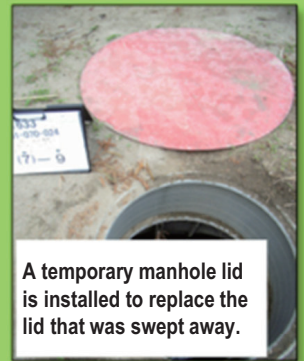
A temporary manhole lid is installed to replace the lid that was swept away.