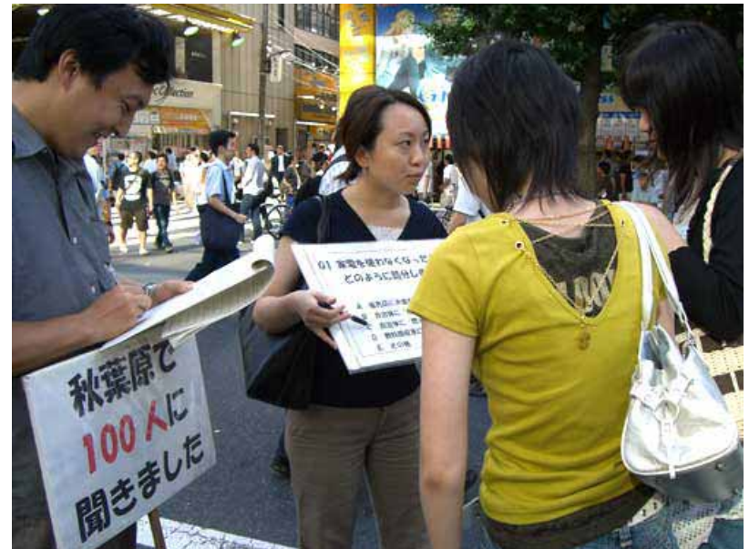
street consumer questionnaire