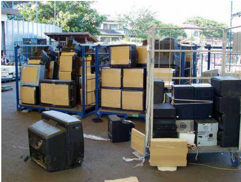
Exporter of secondhand appliance