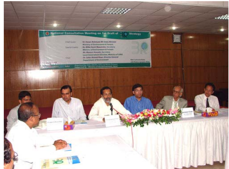
September 10, 2009 National Consultation Meeting