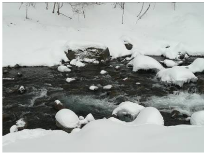
Modified dam on Iwauketsu River