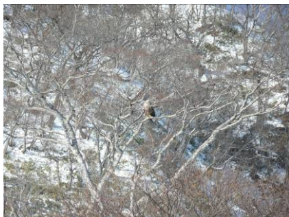
White-tailed Sea Eagle