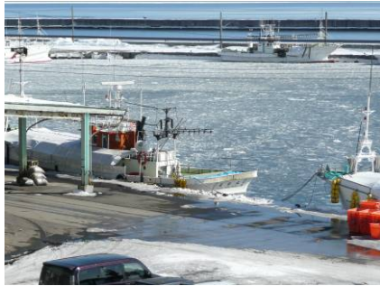
View of Rausu Port