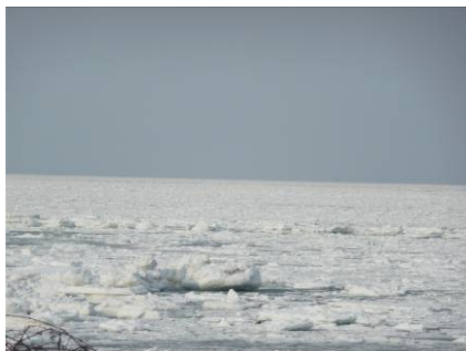
Sea-ice formation off Shari Town