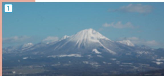
Mt. Daisen viewed from Mt. Hatsuka

In Tottori Prefecture a movement is underway to promote eco-tourism under the motif " Sumayon ni tabi suru " ("to travel to a place like you live there").