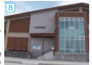
Mt. Daisen Museum of Nature and History

Hours of operation: 9:00AM - 5:00PM (open till 6:30PM in summer) Closed: Yearend thru New Year's holiday. Free entry.