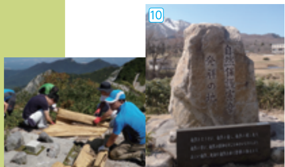
Preservation work at the summit of Mt. Daisen (laying ground coverings)