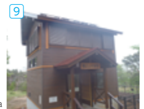
Mt. Senjo rest area

Open: End of Apr thru Nov (closed in winter)