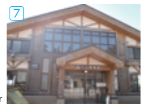
Mt. Daisen Information Center

Open: 8:00AM - 6:30PM (may be open longer in winter) Open all year. Free entry.