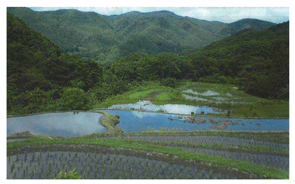
Picture: Terraced paddy fields in early summer in Sado City