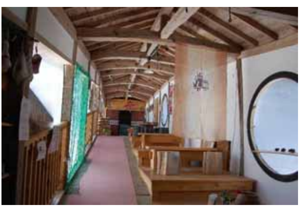
Picture: Open Café (Inside Keiganji Temple, one of the Five Temples of Kanakura)