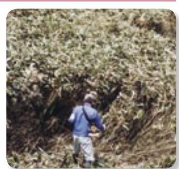
Removing bamboo grass

Traditional management had sustained the pampas grassland in the Ueyama Highland. However, because of recent cessation of mowing and other practices, Bamboo grass and shrub trees have invaded into the grassland. Currently, the effectiveness of mowing and cutting in preserving the pampas grassland is being tested.