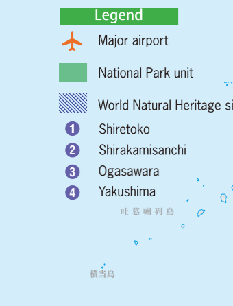
(Map design by WINDCITY)

Subtropical oceanic islands of over 30 islands are scattered in the 1000km south of Tokyo. Humpback whales migrate to the surrounding ocean. The islands support many endemic species such as Ogasawara fruit bat. Inscribed on the World Natural Heritage List on June 2011.