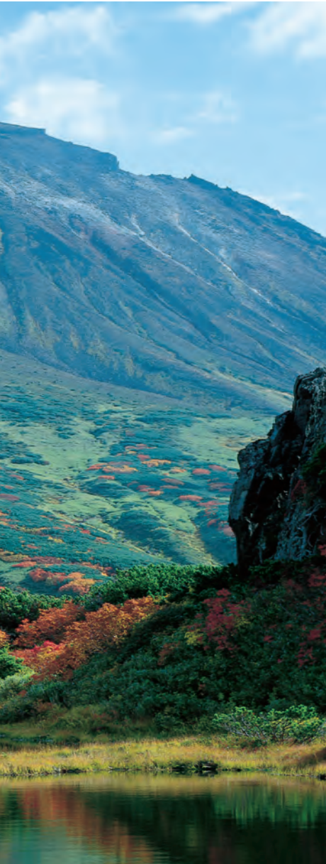
Mt. Asahidake, seen from mire pools in autumn color (Taisetsusan NP) (1)