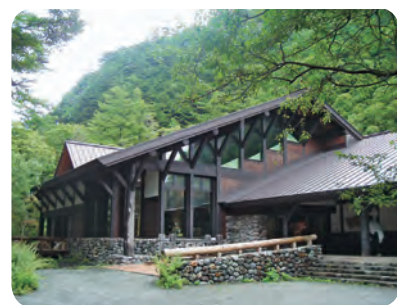
Kamikochi Visitor Center (Chubusangaku NP)

Visitor centers are the park facilities introducing special qualities of natural objects and processes in the park, to assist visitors to understand better and enjoy the park. Park visitors can learn about the park's scenic views and wildlife from the presentation of replicas, posters, diorama and videos. Real-time wildlife information, such as about blooming flowers and bear sightings, and information on the best hiking trails are also available. Use these free visitor centers to plan your activities and destinations in the National Parks.