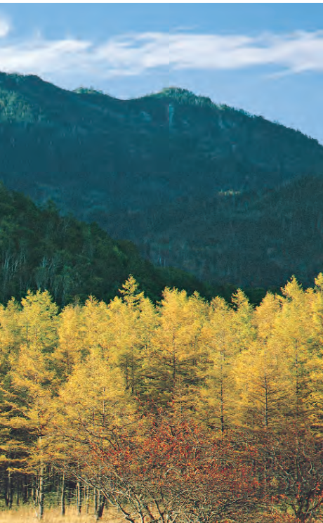
Autumn leaves and Ryuzuno-taki Fall (Nikko NP) (4)