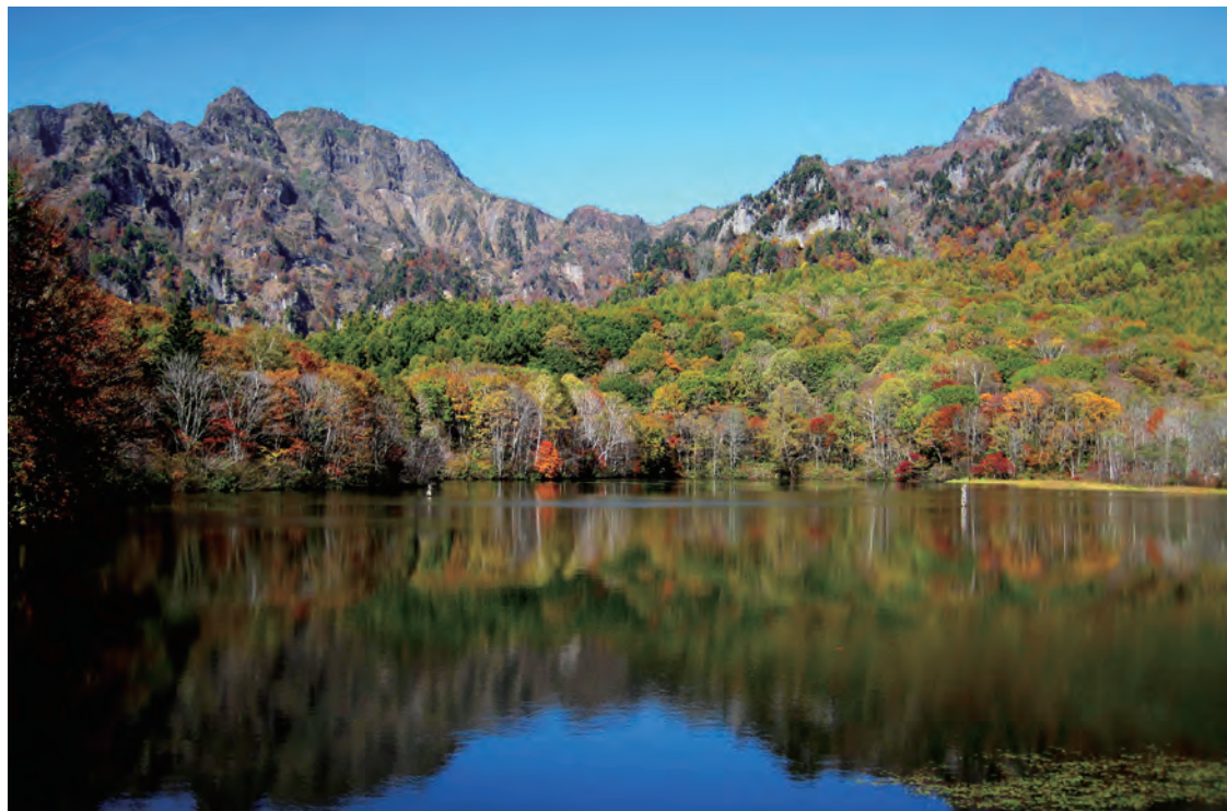
Togakushi mountain range seen from Kagami Pond (Myoko-Togakushi renzan NP)