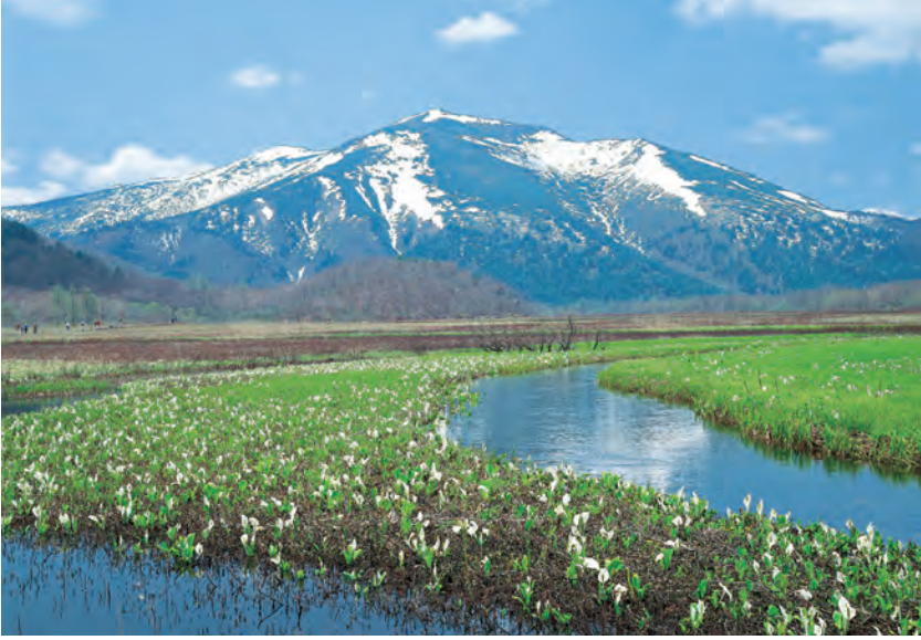
Asian skunk cabbage in Oze Marsh (Oze NP) (2) Wild azaleas and the Kuju Mountain Range (Aso-Kuju NP) (3)