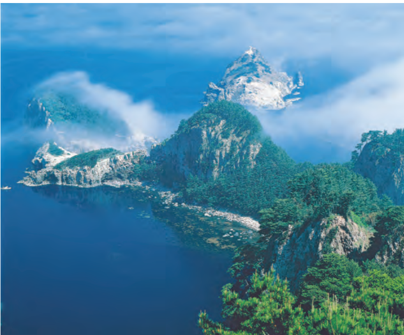
A cape in a sea mist, Okino-shima Island (Daisen-Oki NP) (4)