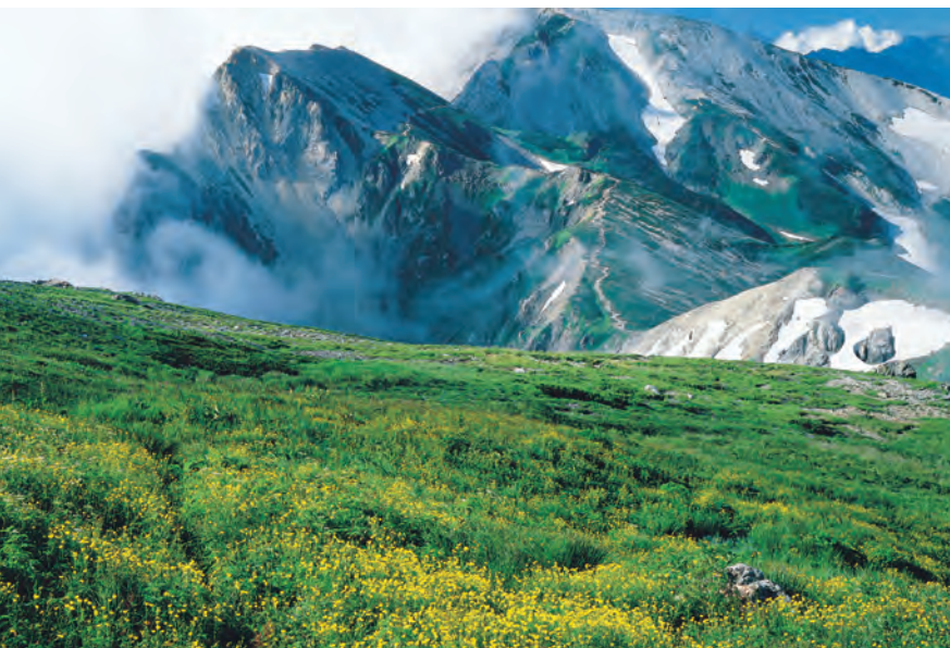
A flower carpet spreading over near the summit of Mt. Hakuba-dake, the Japan Northern Alps (Chubusangaku NP) (2)