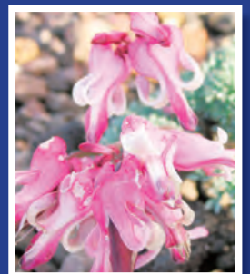
Komakusa ( Dicenta sp.)

Summer is the season for mountain hiking. The mountains in north of central Japan offer an amusement for hikers to spot fields of wildflowers. As climbing a mountain trail patiently, where trees become sparse, hikers will find the garden of colorful alpine flowers spreading like a carpet. Alpine plants are adapted to harsh alpine environments such as low temperatures, strong wind and prolonged periods of snow pack. Most species bloom all at once in the short summer. The lovely life forms determined to survive in such severity is a remarkable view, etched into hiker's memories.