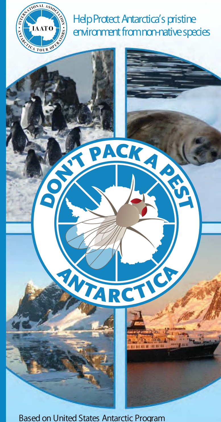
Don't Pack a Pest Leaflet