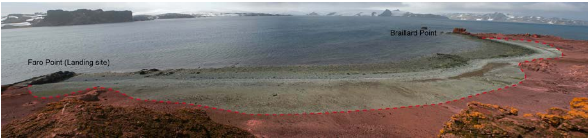
View to the site from Faro Hill. Entry into the ASPA (red area) is prohibited without a permit.