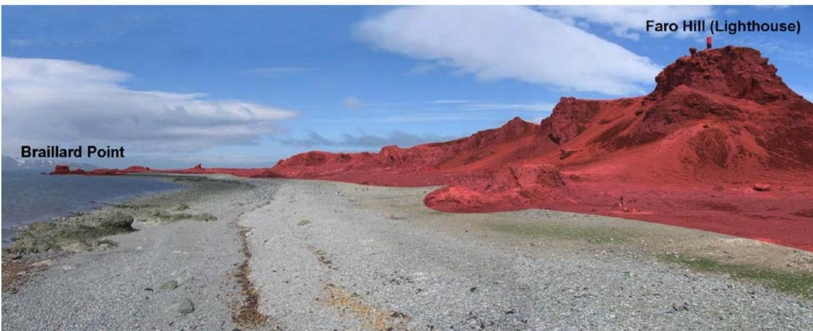
View to the site from Faro Point, the landing point to visit this site. Entry into the ASPA (red area) is prohibited without a permit