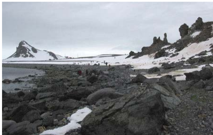
Overview of the south coast of Half Moon Island