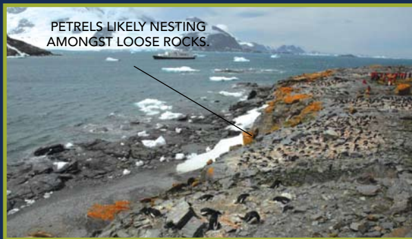
Adélie colony area

Strong winds and tidal variation can bring pack and brash ice quickly onto the beach area. Strong tidal variation can result in small growlers and bergy bits being stranded in the shallow area off shore. These can fracture suddenly during stranding or subsequent re-floating.