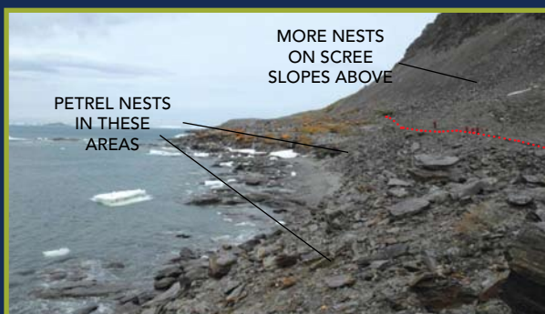
Access route from primary landing