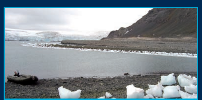
Yankee Harbour landing site