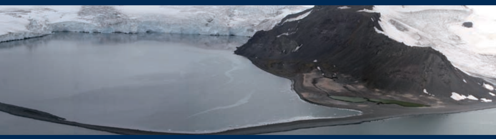
Yankee Harbour from above: showing the gravel spit enclosing the landing beach