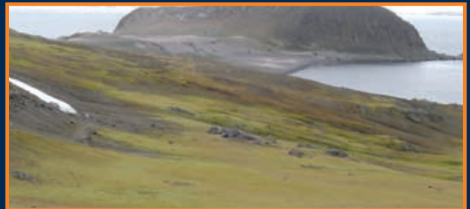
The centre of Barrientos Island is covered by a very extensive moss carpet