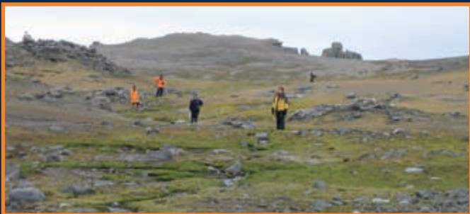
Only walk through Closed Area B if you can clearly recognise the route