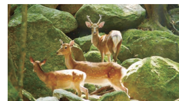
Cervus nippon yakushimae