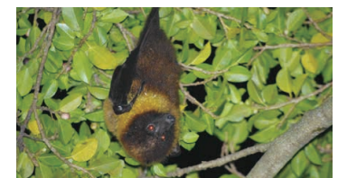
Pteropus dasymallus dasymallus