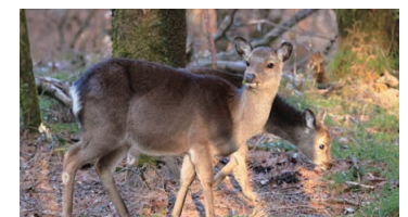
Deer (Ebino Plateau)