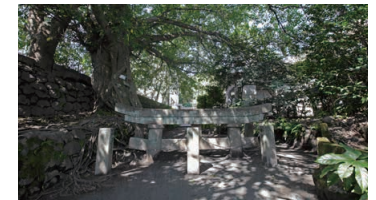
Kurokami Buried Shrine Gate