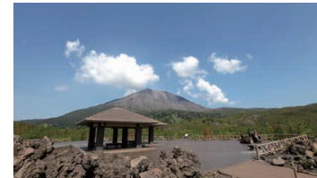
Arimura Lava Observatory