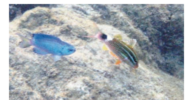
Sphire Devil Damselfish and Blacksaddle Goatfish