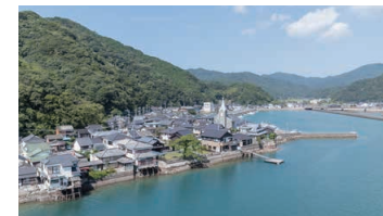
Bell View Park of chapel with a view of church