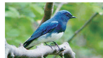
Blue-and-white Flycatcher (Cyanoptila cyanomelana)