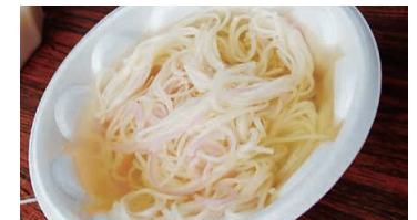
Shimabara Somen Noodles