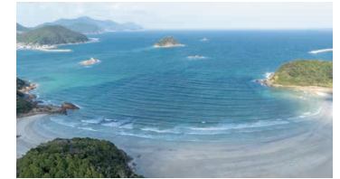
Hamaguri-hama Swimming Beach