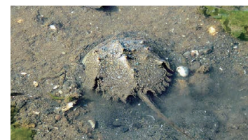
Japanese Horseshoe Crab