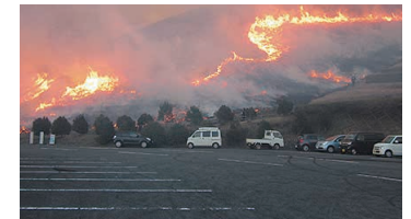
Controlled Burns of the Fields of Mt. Onidake