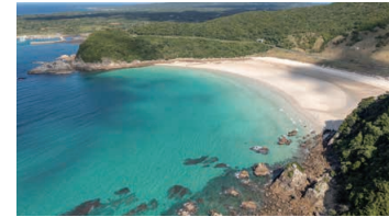
Takahama Swimming Beach

Enjoy the ocean, rivers, and other water scenery