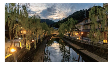
Kinosaki Onsen Shrine