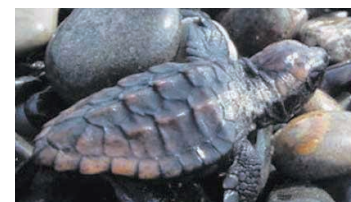
A Newly Hatched Loggerhead Turtle