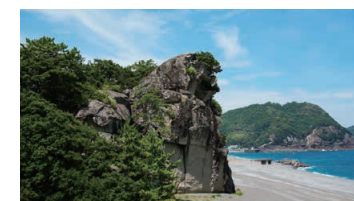
Shishiwa (Lion Rock)