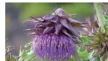
Mount Fuji Thistle