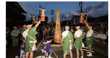
Mt. Fuji Festival