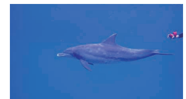
Indo-Pacific bottlenose dolphin