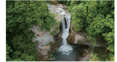
Okushiga Valley Waterfalls