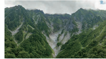
Ichinokurasawa of Mt. Tanigawa