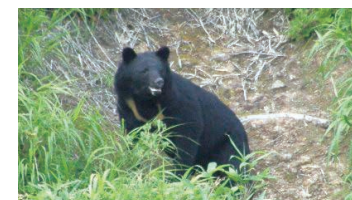
"Tsukinowaguma(Moon-ring Bear)" Asian Black Bear