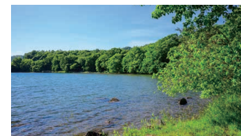
Takarada Nature Observation Trail Waterfront Forest Lane