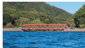
Yamasen Steel Bridge