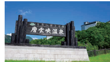
Sounkyo Onsen (hot springs)