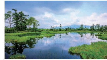
Numa-no-Hara High Moor

Enjoy the ocean, rivers, and other water scenery