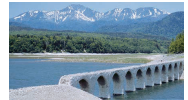
Taushubetsu River Bridge