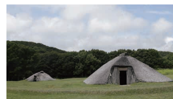
Hokuto Archaeological Site