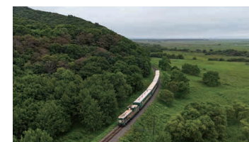
Kushiro-Shitsugen Norocco Train