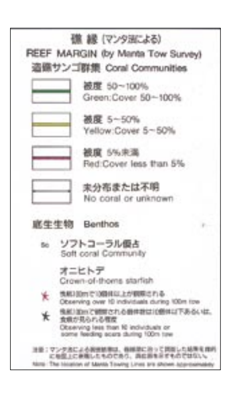
Fig. 1. Legend for the coral distribution map of the Coral reef region.