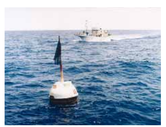
Photo 1. A fish aggregating device ( Payao) established by the le Fisheries Cooperative off lejima Island.