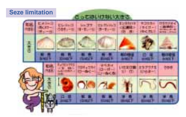
Fig. 3. An example of the size limitations on important benthic fishery resources in Okinawa region, according to the Fishery Regulation of Okinawa Prefecture. (From the Web site, http://www.pref.okinawa.jp/suisan/sangogakkou/ sangogakkou5.htm).

times considered a violation of fishery rights for a person who is not a union member of the managing fishery cooperative to collect benthic resources in the designated common fishery rights district.