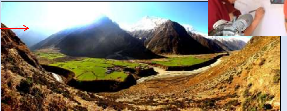
Protected Areas of Nepal