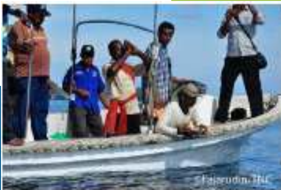
Traditional ceremony at sea.