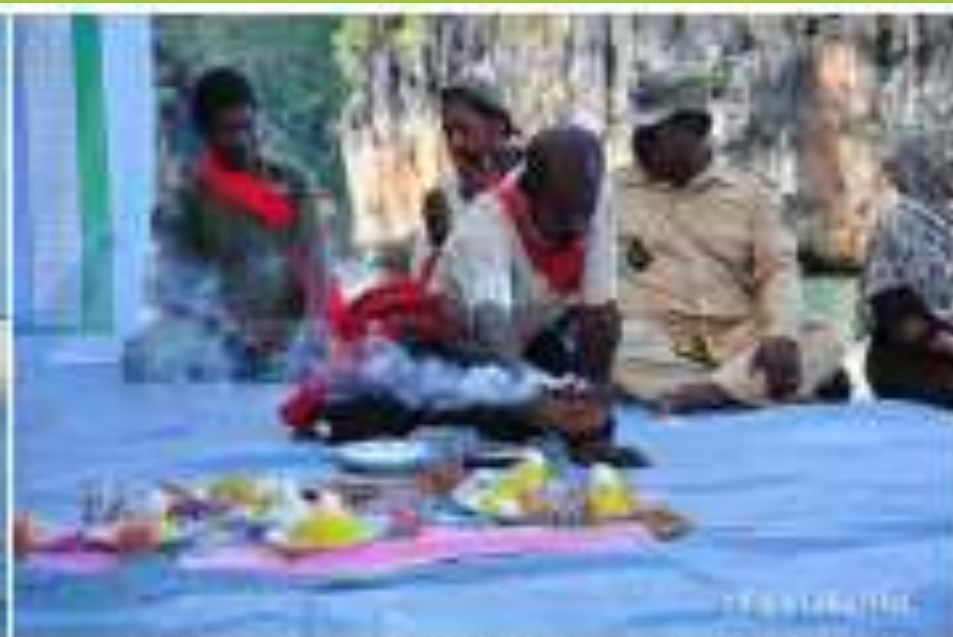
Timor ceremony led by Misool traditional leaders.