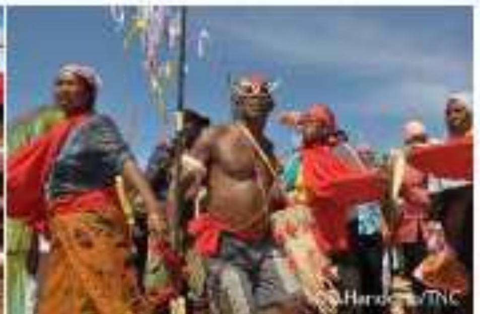
Communities celebrating their declaration.