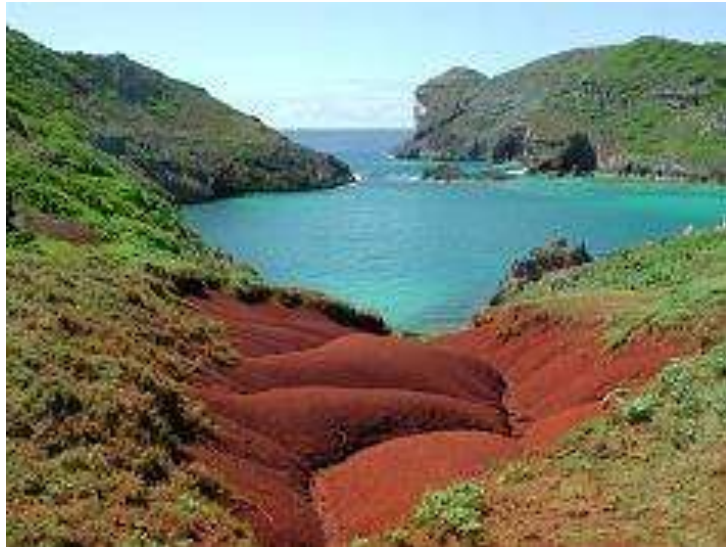
Ogasawara Islands (Minamijima)

To stop destruction of the landscape and ecosystem through by overuse