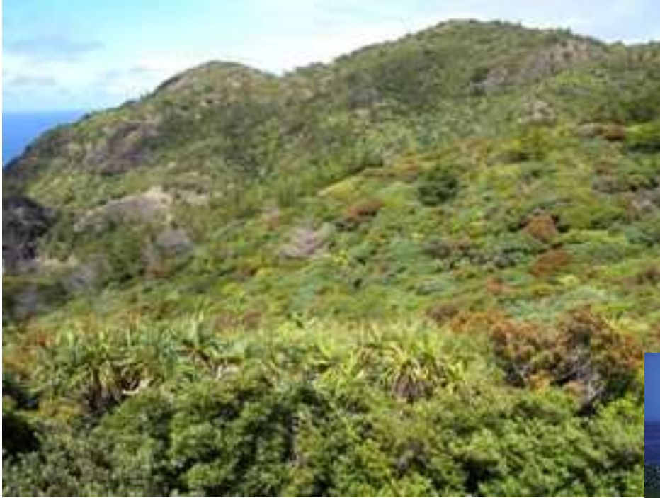
World Natural Heritage Site Ogasawara Islands (Anijima)