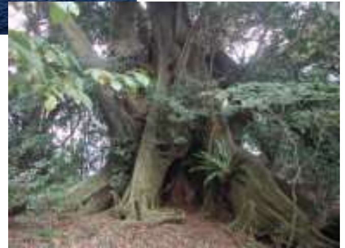
Castanopsis sieboldii ①