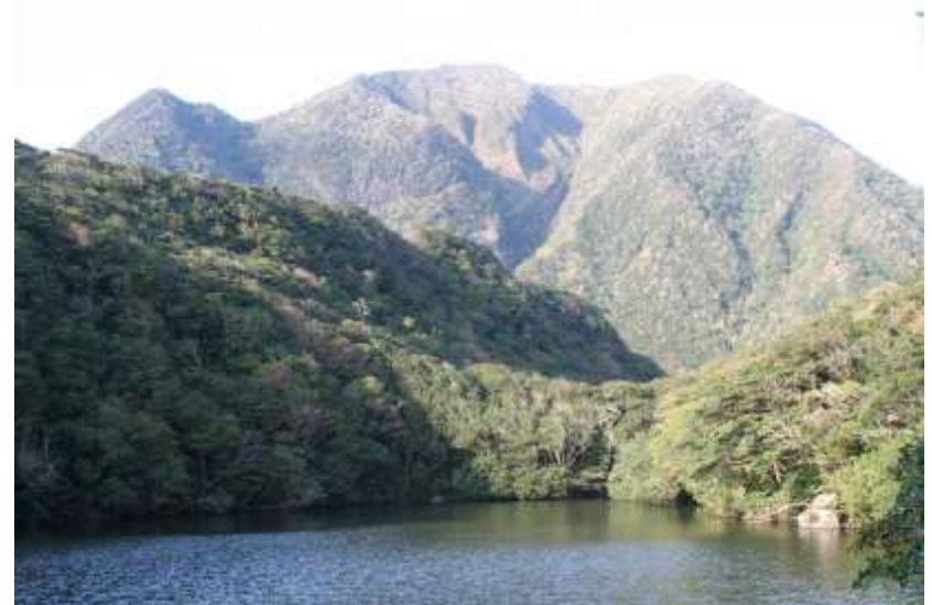
Summit of Mikurajima Island