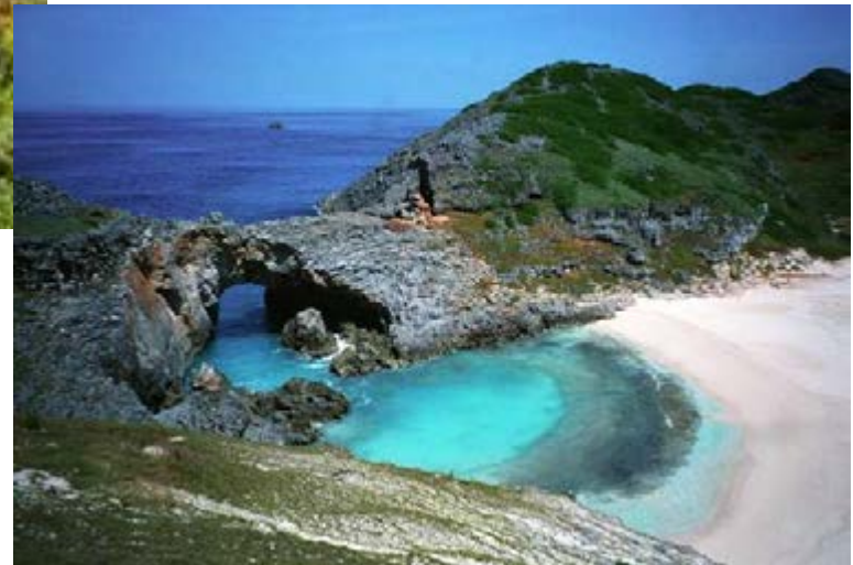
World Natural Heritage Site Ogasawara Islands (Minamijima)