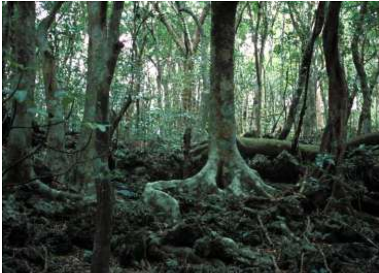
Ogasawara Islands (Hahajima-Sekimon)