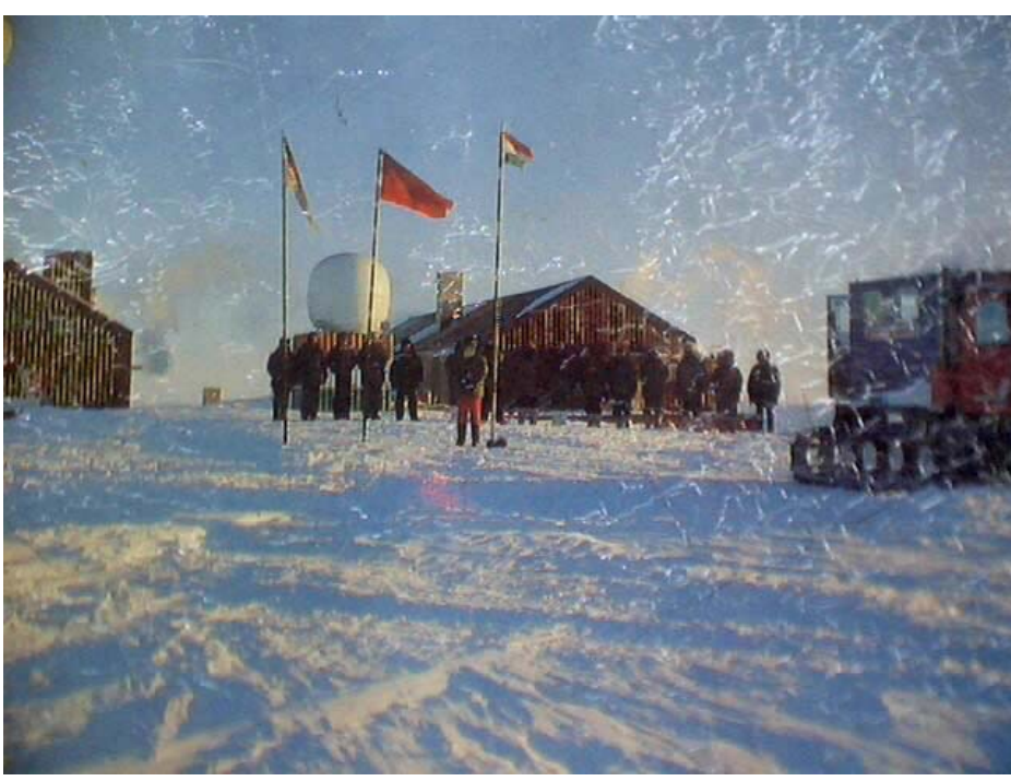
Figure 2 : Dakshin Gangotri Station