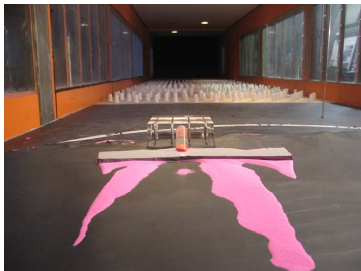
Fig 2.26 WTT-3: Sand erosion testing with garage building integrated.