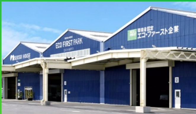
EXTERIOR WALL DISPLAY