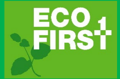
THE OFFICIAL ECO-FIRST LOGO

Through this program, the MOE helps private companies contribute to achieve SDGs goals, while promoting public private partnership.