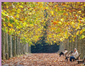
Autumn colors of the sycamore trees

The present site of Shinjuku Gyoen was originally one part of the Edo residence of Lord Naito, a vassal of Ieyasu Tokugawa. In the Meiji era, it became an agricultural experiment station, and then in 1906 it was made into an imperial garden. After the war, in 1949, it was opened to the public as a national garden. The garden contains three styles, Landscape Garden, Formal Garden, and Japanese Traditional Garden, and is considered to be one of the most important modern Western-style gardens of the Meiji era.