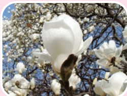
② Yulan magnolia