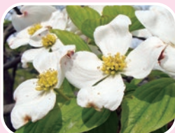
⑥ Flowering dogwood