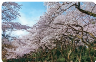
Cherry Tree Area

In Japan, enjoying cherry blossoms is a Japanese custom of welcoming spring. Here we introduce the most popular areas for cherry blossom viewing in Shinjuku Gyoen, which has 1,000 cherry trees of 65 different varieties planted in the garden.