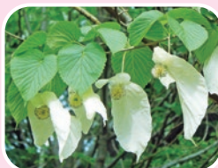
⑧ Handkerchief tree