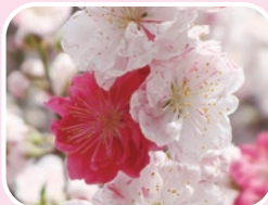
④ Peach 'Genpei'