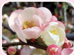
① Japanese quince