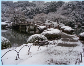
Japanese Traditional Garden

The present site of Shinjuku Gyoen was originally one part of Edo residence of the Lord Naito, the vassal of Ieyasu Tokugawa. In the Meiji era, it became an agricultural experiment station, and then in 1906 it was made into an imperial garden. After the war in 1949, it was opened to the public as a national garden. The garden contains three styles, Landscape Garden, Formal Garden, and Japanese Traditional Garden, and is considered to be one of the most important modern western style gardens in the Meiji era.