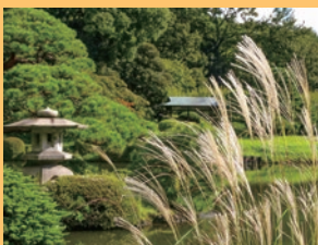
Japanese Traditional Garden

The present site of Shinjuku Gyoen was originally one part of Edo residence of the Lord Naito, the vassal of Ieyasu Tokugawa. In the Meiji era, it became an agricultural experiment station, and then in 1906 it was made into an imperial garden. After the war in 1949, it was opened to the public as a national garden. The garden contains three styles, Landscape Garden, Formal Garden, and Japanese Traditional Garden, and is considered to be one of the most important modern western style gardens in the Meiji era.