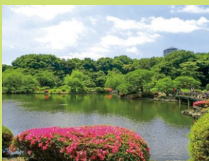
Japanese Traditional Garden

The present site of Shinjuku Gyoen was originally one part of Edo residence of the Lord Naito, the vassal of Ieyasu Tokugawa. In the Meiji era, it became an agricultural experiment station, and then in 1906 it was made into an imperial garden. After the war in 1949, it was opened to the public as a national garden. The garden contains three styles, Landscape Garden, Formal Garden, and Japanese Traditional Garden, and is considered to be one of the most important modern western style gardens in the Meiji era.