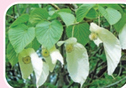
⑧ Dove tree