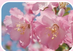
⑤ Hall crab apple