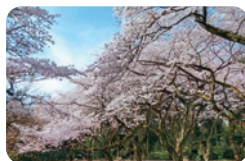
Cherry Tree Area

There are about 1,000 cherry trees of 68 varieties in Shinjuku Gyoen, ranging from early to late blooming. Here we introduce the most popular viewing areas in the garden.