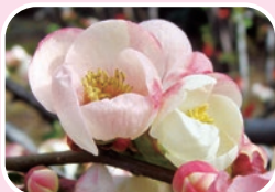
① Japanese quince