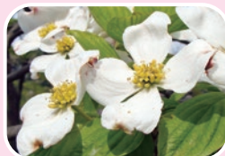
⑥ Flowering dogwood