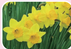
③ Wild daffodil