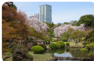
Japanese Traditional Garden