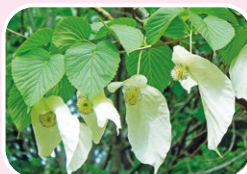
⑧ Dove tree