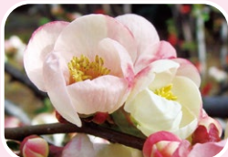
① Japanese quince