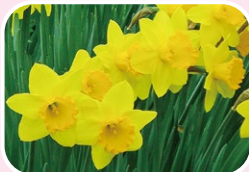
③ Wild daffodil