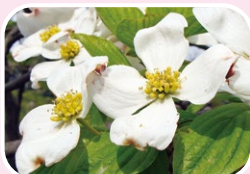
⑥ Flowering dogwood