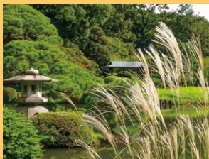
Japanese Traditional Garden

The present site of Shinjuku Gyoen was originally one part of Edo residence of the Lord Naito, the vassal of Ieyasu Tokugawa. In the Meiji era, it became an agricultural experiment station, and then in 1906 it was made into an imperial garden. After the war in 1949, it was opened to the public as a national garden. The garden contains three styles, Landscape Garden, Formal Garden, and Japanese Traditional Garden, and is considered to be one of the most important modern western style gardens in the Meiji era.