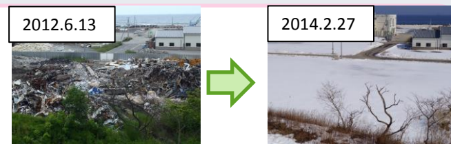
The temporary storage site clearing progress (Hirono town, Iwate Prefecture)

Major public works projects using materials recycled from debris and tsunami deposits